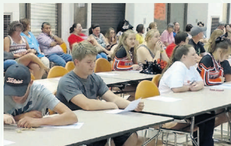
New Freshmen get their schedules on orientation night and prepare to walk through a routinely scheduled day the HS. Knowing where everything is and where rooms are on the first day of school is a must